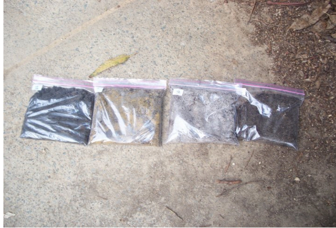
Figure 2: Different types of soil

Students could start to evaluate their values of the environment. Therefore, the fieldwork activity proved to be a catalyst in processing information on environmental care.