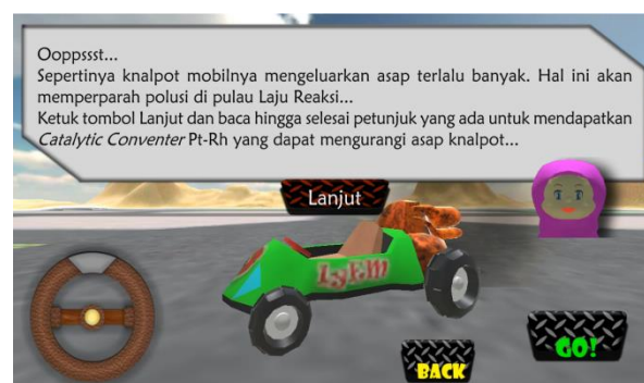
Figure 2. Exercise Menu in Chemsdro

The results of the questionnaire responses of students on aspects of interest in the learning media showed a very good category which means that students' learning motivation increased by using Android-based learning media. This is based on the research of Pramuditya et al. (2017) which states that the game can be a learning medium to improve the development of a person's brain in motor power, cognitive, spiritual, so that the intellectual ability of the learner's brain.